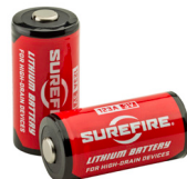
123A LITHIUM BATTERIES Available in 2, 6, 12-packs and bulk options