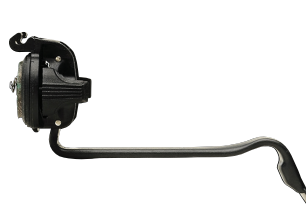
DG SWITCH (Grip switch for handguns) Other appropriate models available