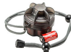
SC1 SPARE BATTERY CARRIER Other appropriate models also available