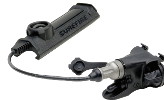
XT07 TAPE SWITCH (Rail attach for long guns) UPC: 084871851282