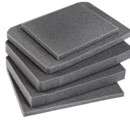
V200FS 4 pc. Replacement Foam Set