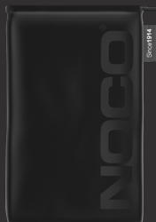
Microfiber storage bag

Presta Valve Adapter Needle Adapter Inflatable Toy Adapter